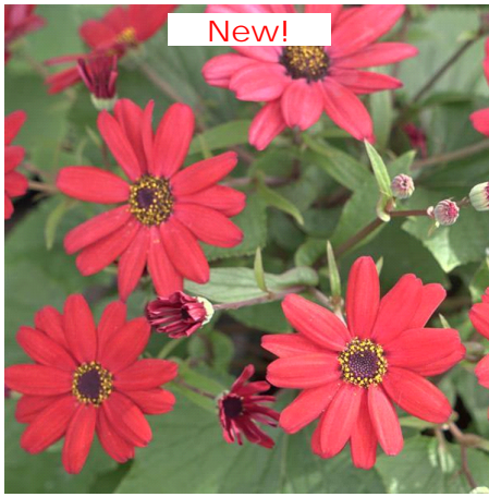
Senetti® Red Pericallis