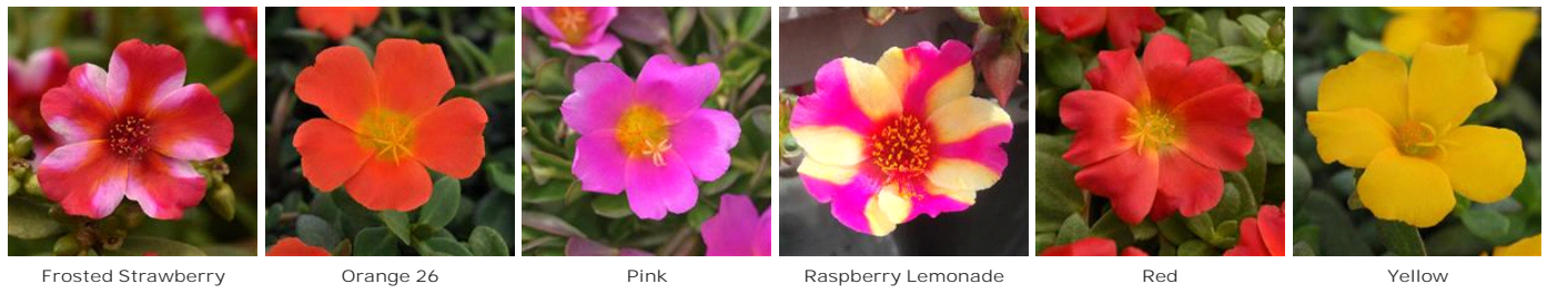
Frosted Strawberry Orange 26 Pink Raspberry Lemonade Red Yellow