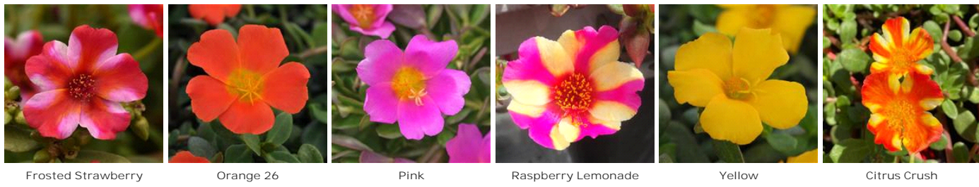
Frosted Strawberry Orange 26 Pink Raspberry Lemonade Yellow Citrus Crush