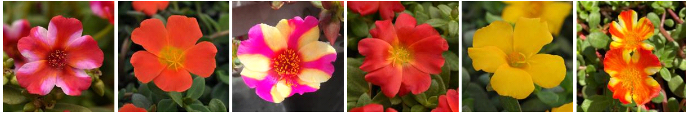
Frosted Strawberry Orange 26 Raspberry Lemonade Red Yellow Citrus Crush