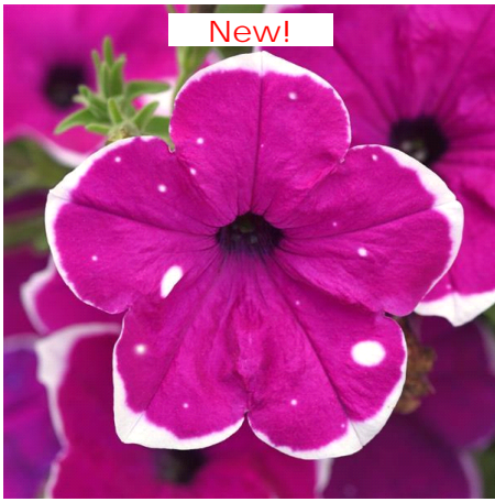
Main Stage™ Magenta Glacier Sky Petunia