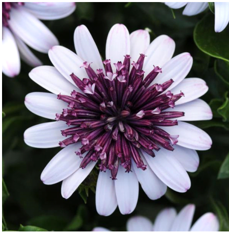
4D™ Berry White Osteospermum