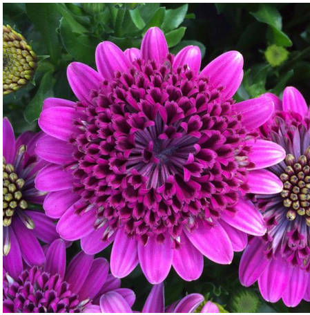
4D™ Purple Osteospermum