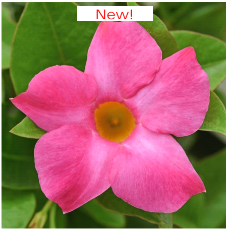
Divina Compact Pink Mandevilla