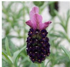
Compact Dark Violet