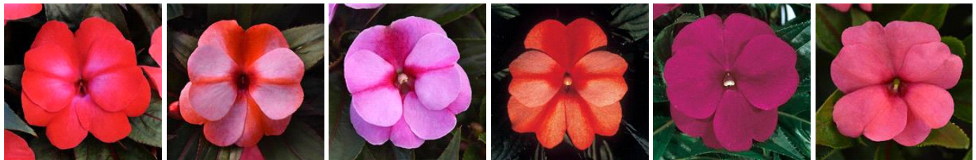
Dark Pink Flame