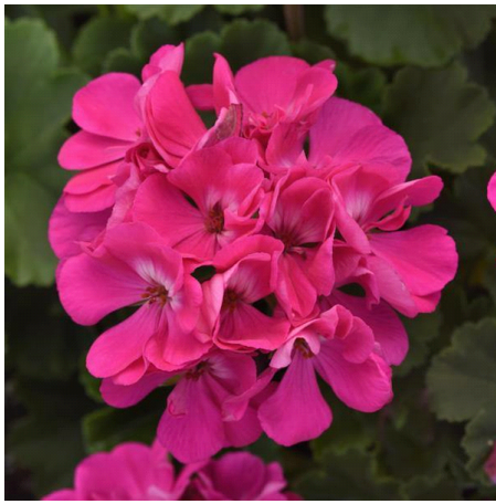
Moonlight™ Blue Zonal Geranium