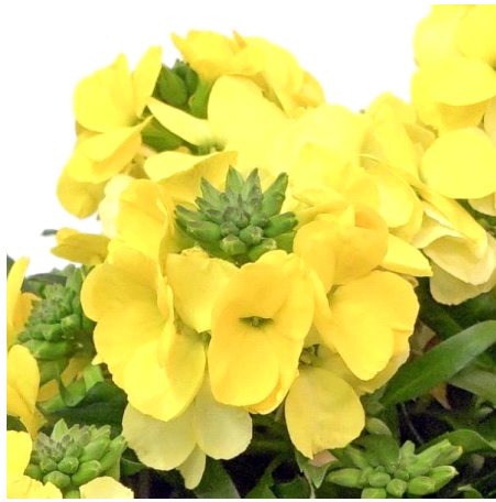
Erysimum Brightside™ Yellow