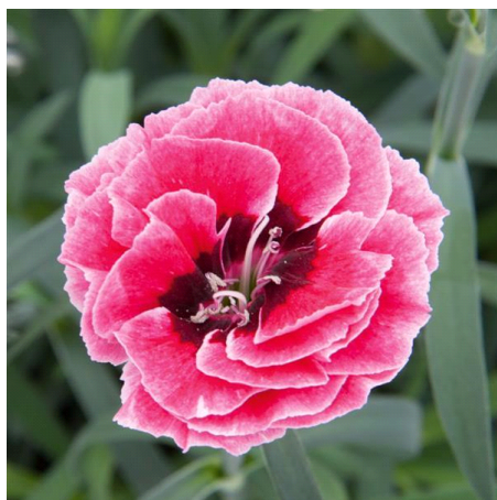
Capitán™ Pink+Eye Dianthus