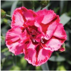
Red + Pink