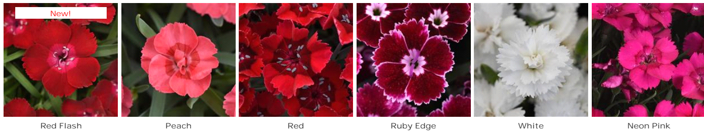
Red Flash Peach Red Ruby Edge White Neon Pink