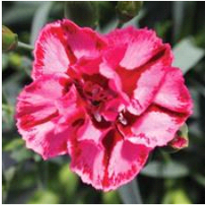
Red + Pink