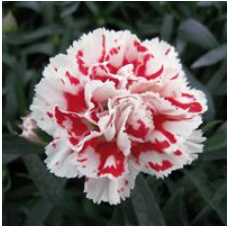
Red + White