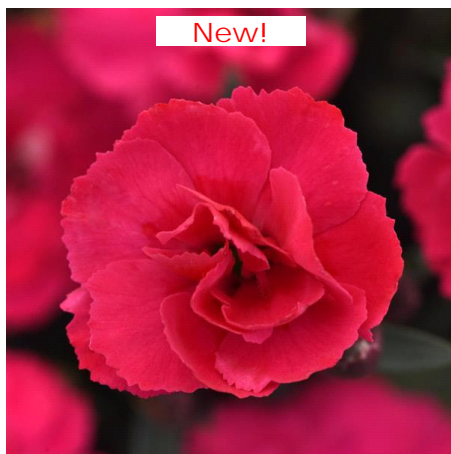
Dianthus Carmen™ Pink