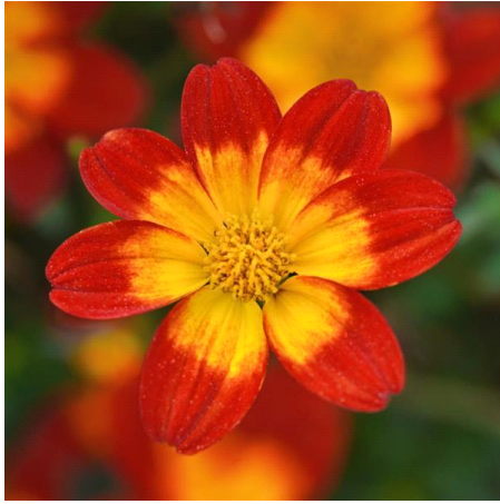
Namid™ Compact Red+Eye Bidens