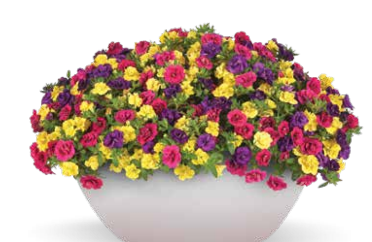
Trixi® Evo-Centric MiniFamous Evo Double Blue, Double Magenta and Double Yellow