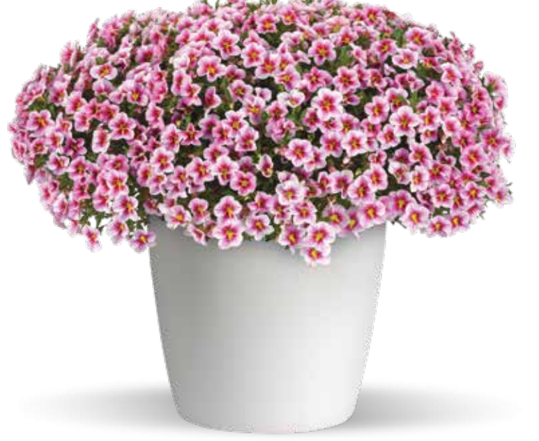
MiniFamous® Uno Pink Starfruit