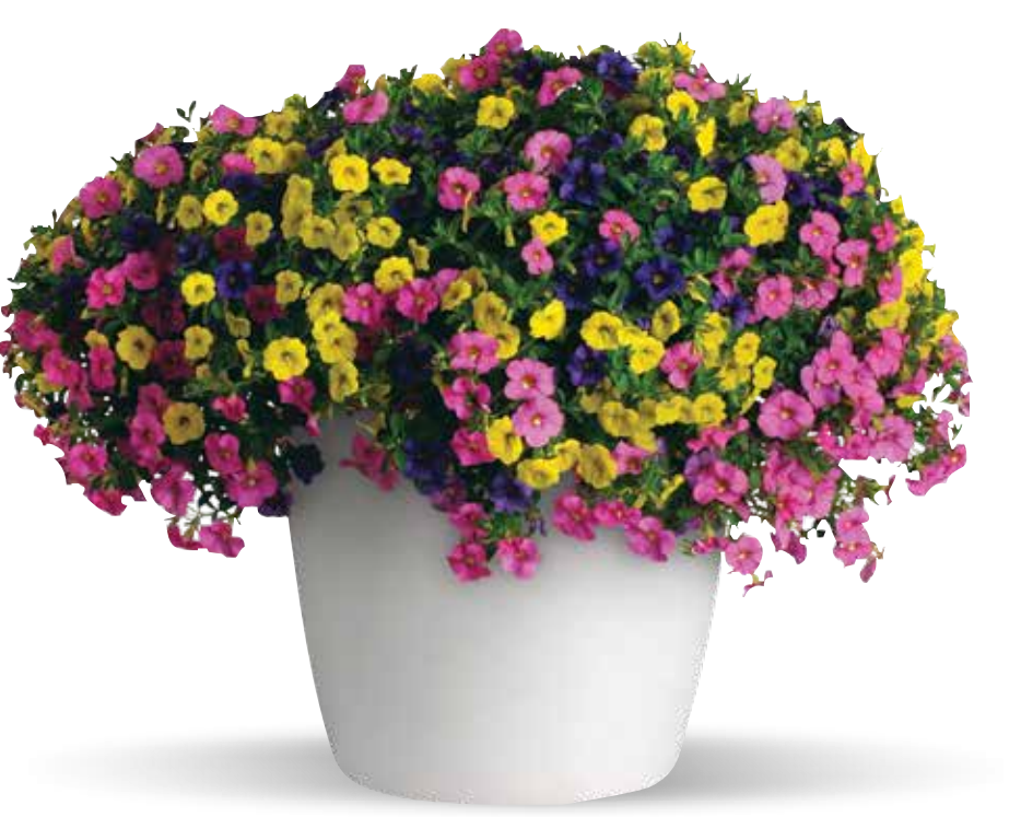
Trixi® Lollipop MiniFamous Neo Blue, Deep Yellow and Pink