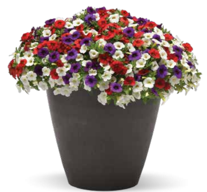
MixMasters™ Home Sweet Home Conga Dark Blue, Red and White