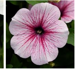
White Rose Vein