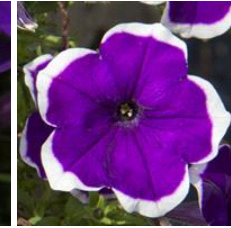
Dark Violet Picotee