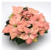
Poinsettia Christmas Beauty Cinnamon