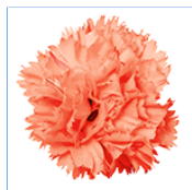
Dianthus Vivacia Orange